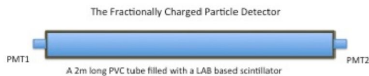
Figure 2 The fractionally charged particle detector.

According to the “Beamline for Schools” document, most of the instrumentation needed to complete this experiment is available at CERN. However, the fractionally charged particle detector will be provided by us, with the help of our contact at the University of Alberta. It would be a very simple and cost effective detector made of a two metre long PVC pipe with a 20 cm diameter and filled with liquid scintillator that would be measured and interpreted by the two photomultipliers, as shown by figure 2. The liquid scintillator we will be using used in the FCPD is LAB based and therefore low cost and environmentally friendly. 1 A large path length for the FCP in the scintillator ensures that an adequate signal can be achieved despite the charges as low as 1/10th of the charge of an electron. A coincidence between the two PMT signals can be used to reduce the “noise” found in our results. The readout for two PMTs (standard parts of the CERN detector) can be used to service the FCPD.